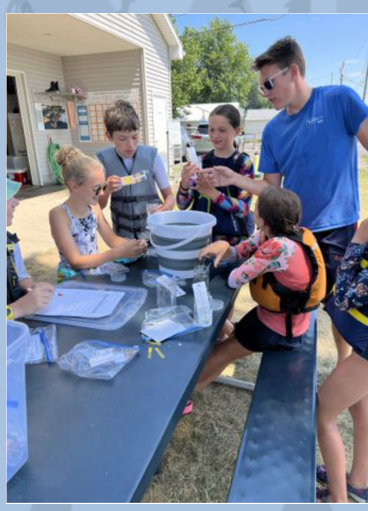
Sodus Bay Junior Sailing Association, New York