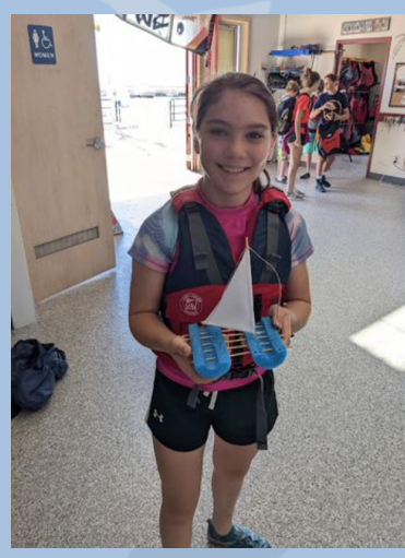
Sheboygan Youth Sailing Center - Wisconsin