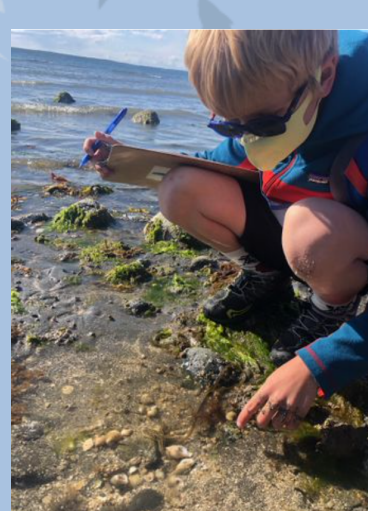
Community Sailing Center - Washington