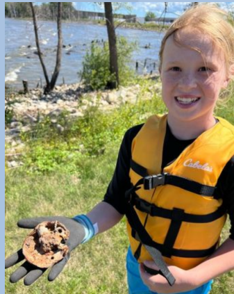
Green Bay Sail & Paddle- Wisconsin