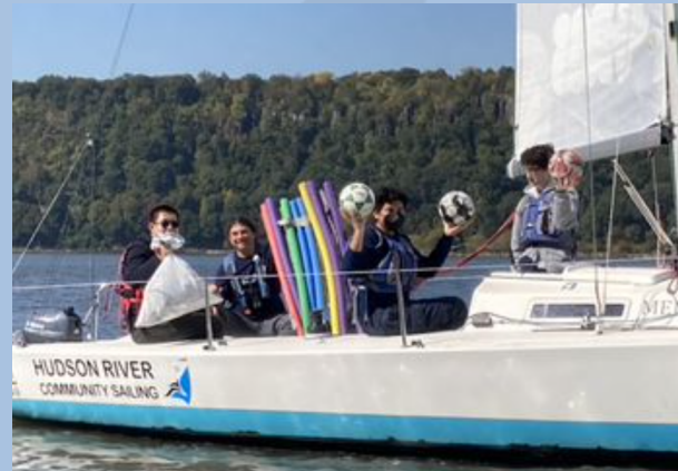
Hudson River Community Sailing - New York

Students feel they will do well in high school classes similar to those subjects in the Reach program.