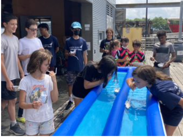
Hudson River Community Sailing - New York