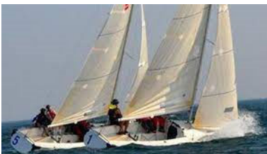
Above, the facilities of the Sheboygan YC and Sail Sheboygan; sailing the Sonars on Lake Michigan. YC.