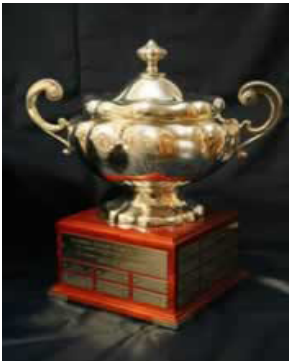
Allegra Knapp Mertz Trophy

In 2000, a motion to change the event from fleet racing to match racing was passed. The first U.S. Women's Match Racing Championship was held at Southern Yacht Club, November 11 – 14, 2002. The Mertz Trophy is awarded to the winner and the Adams Memorial to the runner-up.