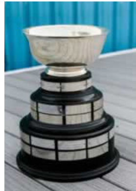
Mrs. Charles Francis Adams Memorial Trophy