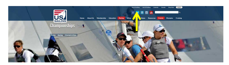
Step 1 – Click on the "My US Sailing" link on the top of the home page