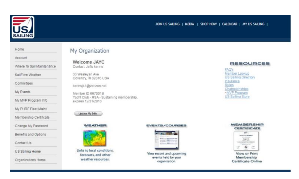
Step 3 – Follow the "My Events" tab from the "My US Sailing" landing page