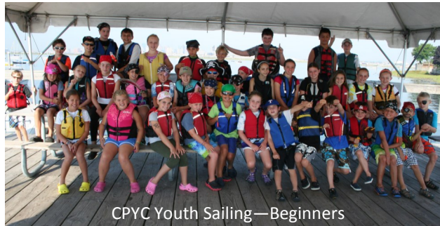
CPYC Youth Sailing—Beginners