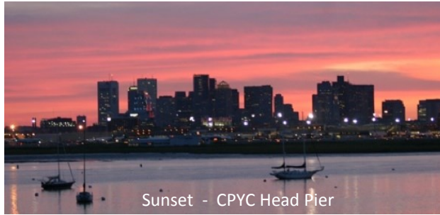
Sunset - CPYC Head Pier

Drawing upon our depth of experience, we will work in tandem with your marketing team to determine what level of sponsorship meets your specific needs and ensure the appropriate level marketing awareness for your investment.