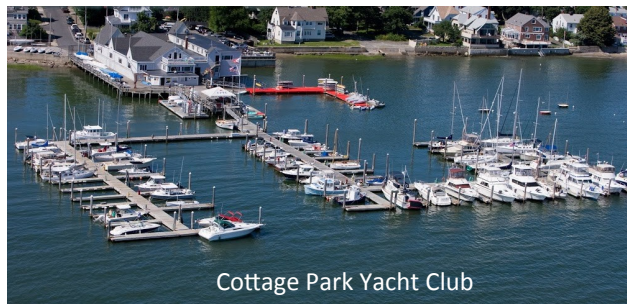
Cottage Park Yacht Club